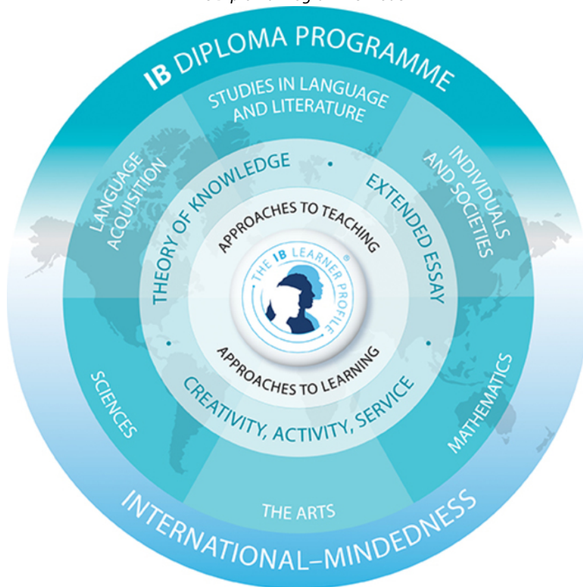
The Diploma Programme model